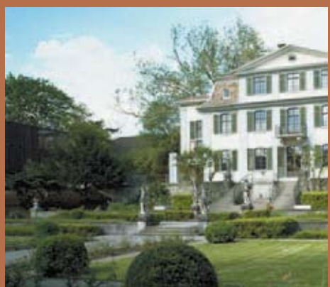
IIHF head office Zurich, Switzerland