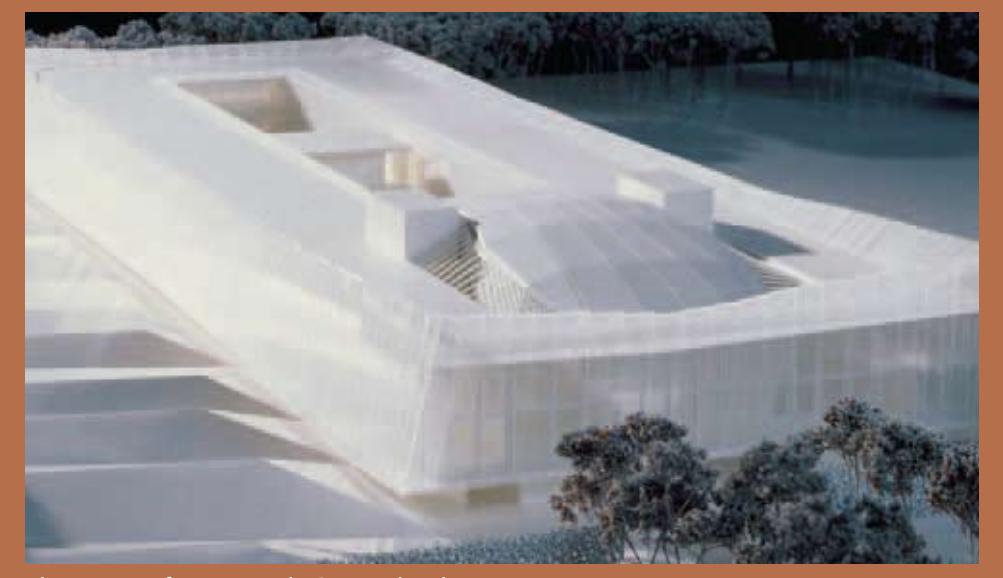
The Home of FIFA Zurich, Switzerland